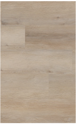
Shaw™ Luxury Vinyl Plank Flooring