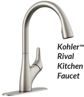
Kohler™ Rival Kitchen Faucet