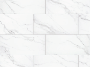
Emser™ Primary Bath Floor & Shower Tile

Curated by our Professional Design Consultants