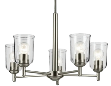
Kichler™ Dining Room Fixture