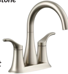
Kohler™ Bath Faucet