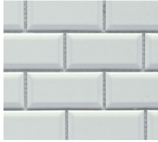
Emser™ Kitchen Backsplash