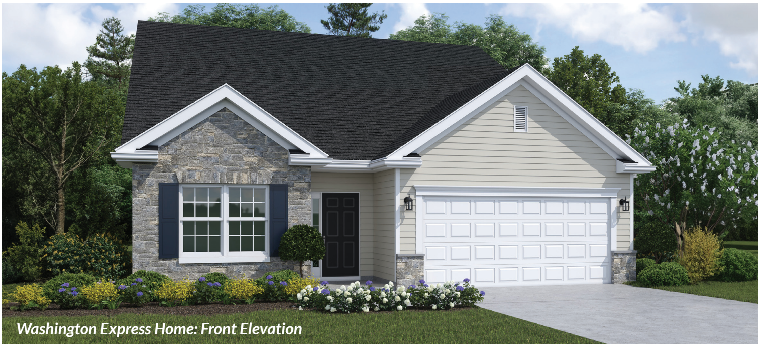
Washington Express Home: Front Elevation

6219 Resolution Point, Chesterfield, VA 23832 | 804-403-8064