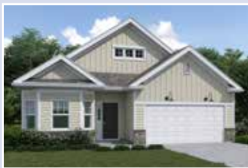
WASHINGTON I OPTIONAL FARMHOUSE ELEVATION