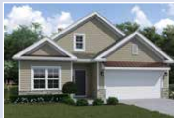
WASHINGTON I OPTIONAL CLASSIC ELEVATION