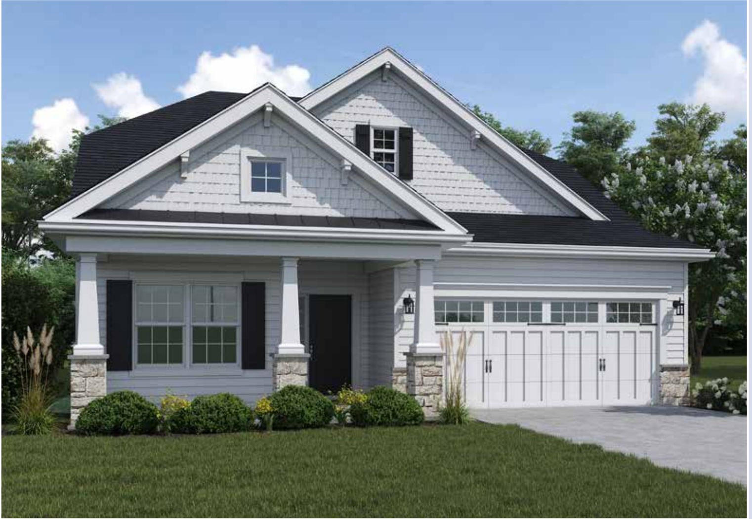
WASHINGTON II • OPTIONAL CRAFTSMAN ELEVATION