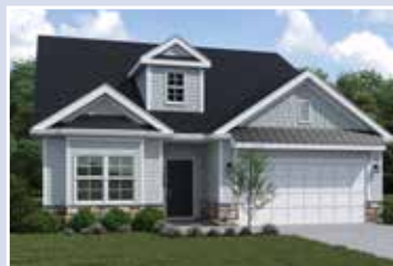
WASHINGTON II OPTIONAL CLASSIC ELEVATION