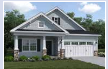
WASHINGTON I OPTIONAL CRAFTSMAN ELEVATION