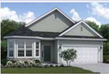
WASHINGTON I TRADITIONAL ELEVATION