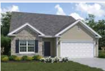
WASHINGTON II TRADITIONAL ELEVATION