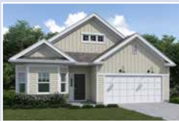
WASHINGTON I OPTIONAL FARMHOUSE ELEVATION