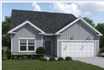
WASHINGTON II OPTIONAL FARMHOUSE ELEVATION