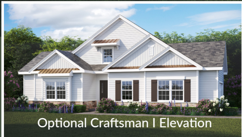
Optional Craftsman I Elevation