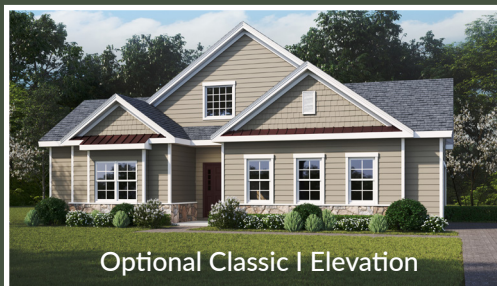
Optional Classic I Elevation