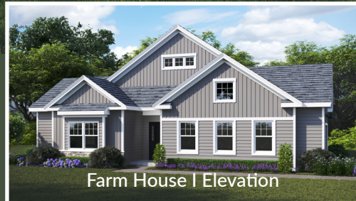
Farm House I Elevation