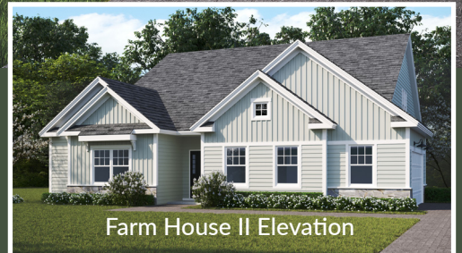
Farm House II Elevation