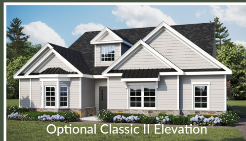
Optional Classic II Elevation