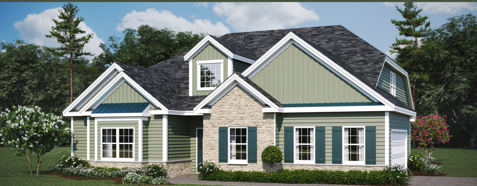
Optional Craftsman II Elevation

This home is stunning at every turn, from the dramatic two-story Foyer to the sun-filled Great Room with gorgeous windows. A chef's dream, the Kitchen showcases an oversized statement island and popular Butler's Pantry. Smart and stylish spaces allow for entertaining both indoors and al fresco .