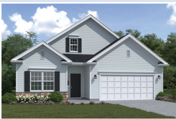
GRANT I TRADITIONAL ELEVATION