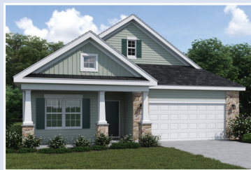
GRANT I OPTIONAL CRAFTSMAN ELEVATION