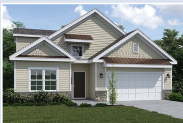
GRANT II OPTIONAL CLASSIC ELEVATION