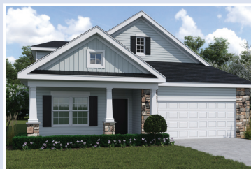
GRANT II OPTIONAL CRAFTSMAN ELEVATION