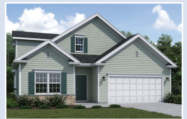
GRANT II TRADITIONAL ELEVATION