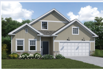
GRANT I OPTIONAL FARMHOUSE ELEVATION