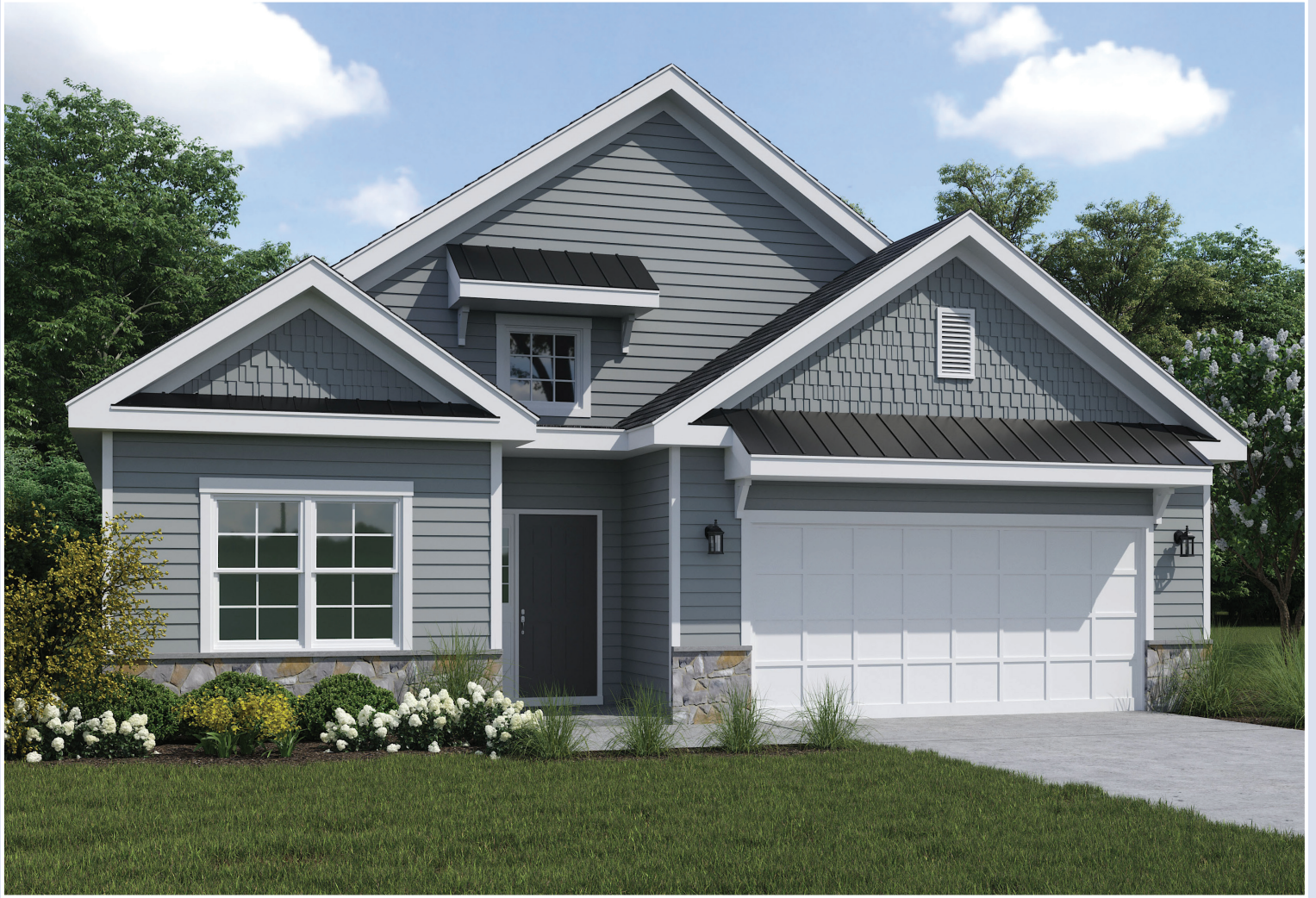
GRANT I • OPTIONAL CLASSIC ELEVATION