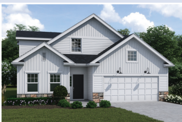
GRANT II OPTIONAL FARMHOUSE ELEVATION